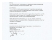
submission ... .jpg 246.4kB