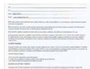
copyright tr... .jpg 357.1kB