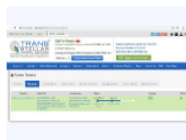
payment IJ... .jpg 172.5kB